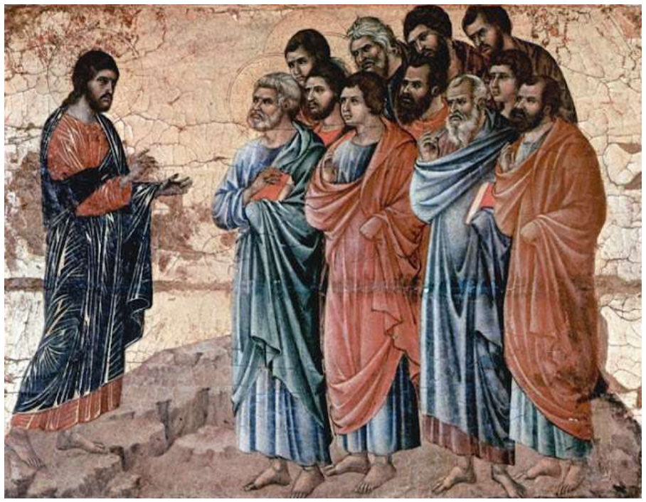
Christ Appears to the Disciples on the Mountain in Galilee, Panel from the Maesta Altarpiece of Siena, Source: http://diglib.library.vanderbilt.edu/act-imagelink.pl?RC=49158, Artist: Buoninsegna di Duccio(d. 1319), License: Creative Commons Attribution Noncommercial ShareAlike 3.0 License