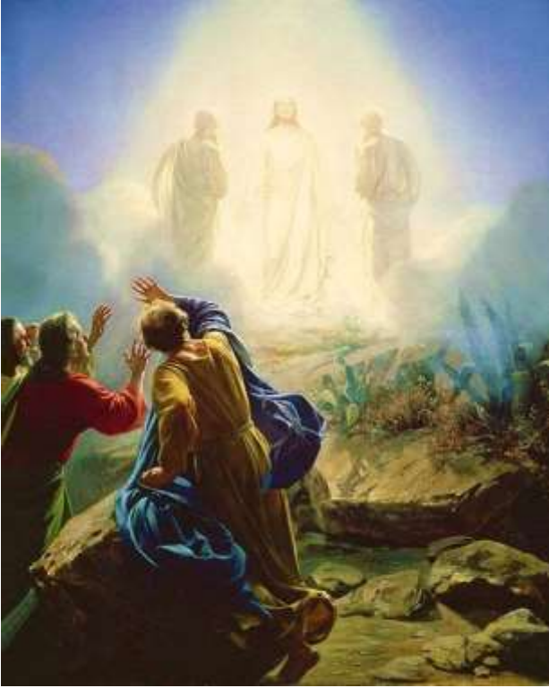
Transfiguration of Jesus, Artist: Carl Bloch (1834–1890)

Transfiguration Sunday February 11 th , 2024 – 10:30 a.m.