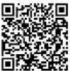
St. B Canada Helps

Sign up for convenient monthly Pre-Authorized Remittance. PAR Forms are available at the back of the church and on our website https://www.stbarnabas-toronto.com/support.html .